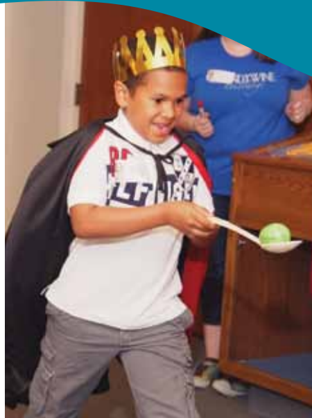
Student tests his speed in the Dragon Egg Relay