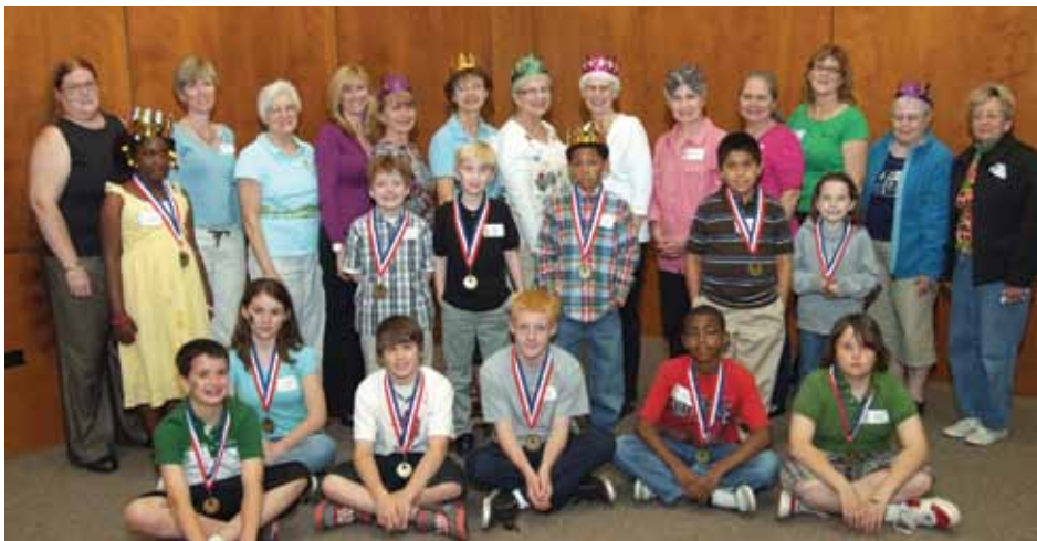
RAI's 2011 Gold Medal Winners and Their Tutors at the Annual Student Party